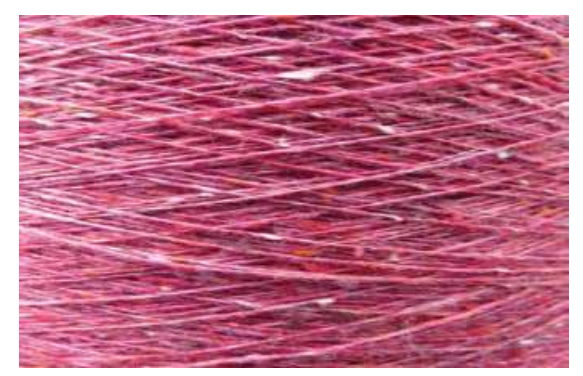
Reclaimed fibres from post-consumer textile waste and re-spun into new yarn