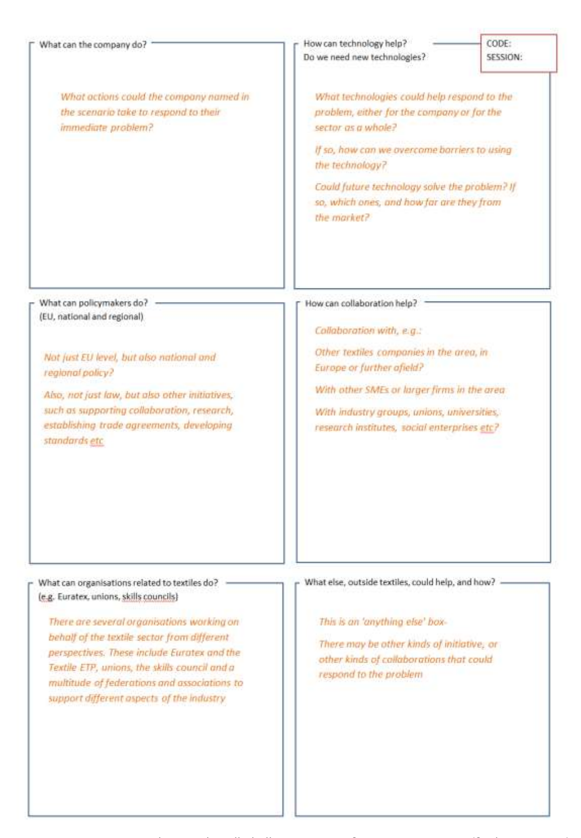
Figure 3: Template used at all Challenge Stations for Proposing Actions (facilitator's copy)

The following sections describe the proposed responses to the challenges and opportunities facing the sector obtained through the four 'Challenge Stations' Innovation, Resources, Trade and Skills .